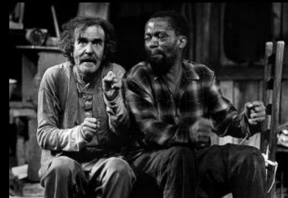
Athol Fugard (left) and Zakes Mokae (right) acting in The Blood Knot

1962 Fugard announces his support for the Anti-Apartheid Movement's international boycott of South African theatres with segregated audiences, and the government places restrictions on his movement and begins surveillance of The Serpent Players