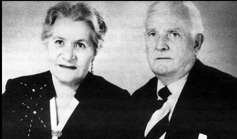
Fugard's parents, photo from Falls the Shadow