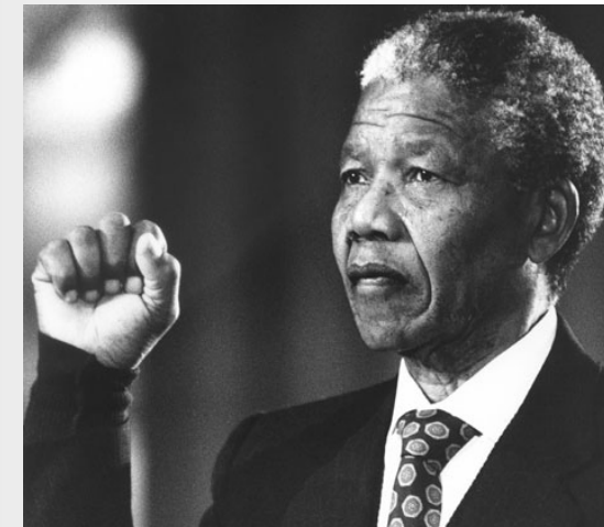
Nelson Mandela, 1985

1994 In South Africa's first full free election, the ANC takes power and Nelson Mandela becomes president