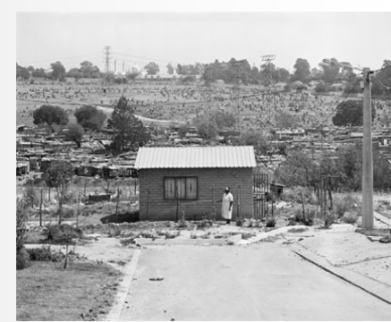
A house from the designated homelands for black South Africans

1800s British colonial powers war with the Boers and Zulus, encouraged by the discovery of gold in Transvaal