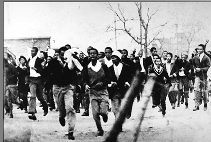
Students fleeing the massacre that followed the Soweto Uprising

1961 Umkhonto we Sizwe (MK), the ANC's militant wing is founded