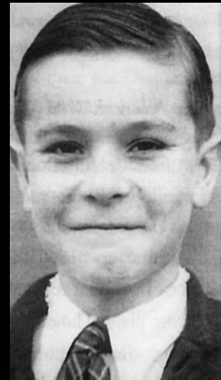
Young Fugard, photo from Falls the Shadow